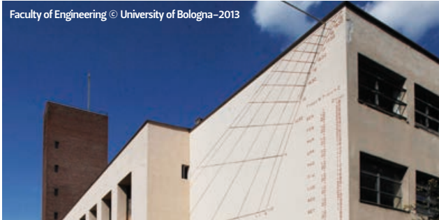
Faculty of Engineering © University of Bologna–2013

the same time, an expression of purity, knowledge and awareness. Its educational functionality is guaranteed by careful division of the interior spaces, as its floor-plan develops to accommodate its function. Externally, the considerable size adapts to its urban setting thanks to the primary use of horizontal lines, interrupted at the entrance by the abrupt verticality of the red brick tower, which is reminiscent of local tradition.