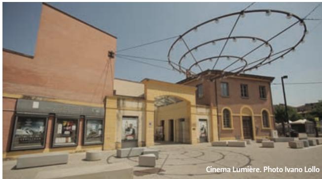
Cinema Lumière.

Since 2000 an intense project of urban regeneration, entrusted to architect Aldo Rossi, has involved the current Manifattura delle Arti , or Factory of Arts. The works have affected all the buildings and spaces that now make up the new Citadel of Art and Culture: the former Manifattura Tabacchi , tobacco factory (Via Riva di Reno 72), with its Art Nouveau façade, no longer houses industrial plants but instead accommodates the headquarters of the prestigious Film Archives and the digital restoration workshop. The 11 Settembre 2001 Park is a public area that is still bordered by the old walls of the former manufacturing plants. The Castellaccio district is used for university and public residences. The former Mulino Tambroni mill is now the University's Department of Media Sciences and the old Forno del Pane , or bakery, is currently the headquarters of MamBo , Bologna's Modern Art Museum. Cavaticcio park, created when the canal overlooked by the old port was reopened and the bridge that marked the boundary between two waterways reproduced, is enhanced by several pieces of contemporary art. Nowadays the former Salara , or salt store, is the headquarters of the LGBT community and cultural centre. The former Macello , or abattoir, houses the Cinema Lumière and the Renzo Renzi