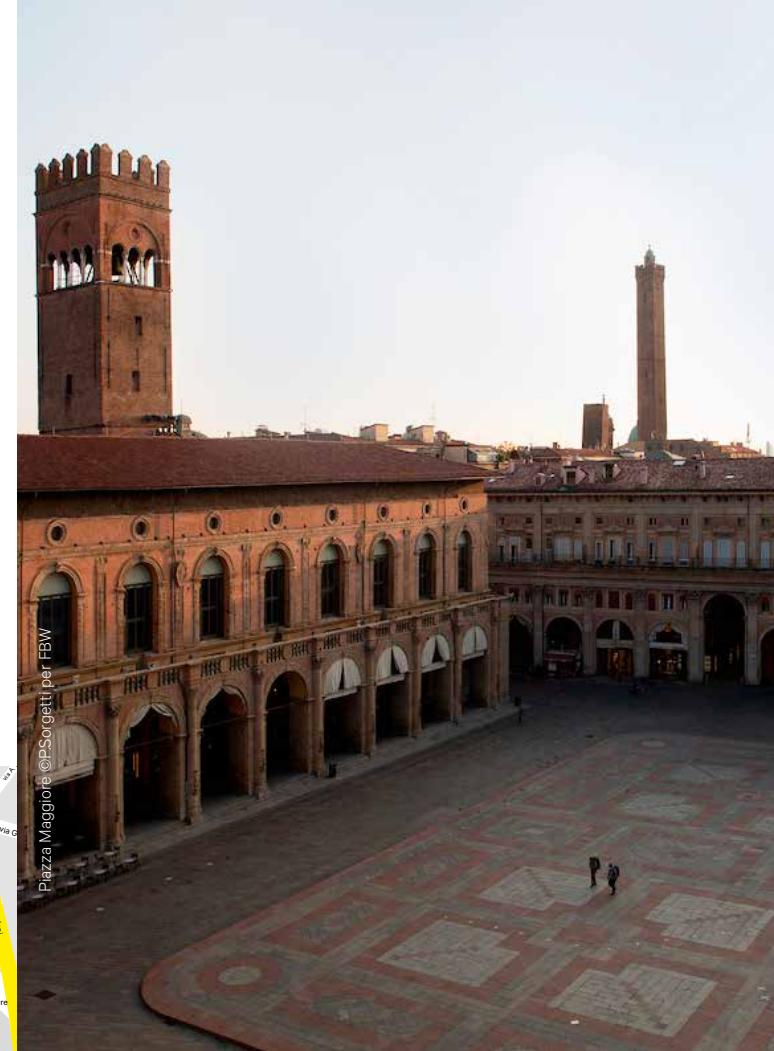
Piazza Maggiore