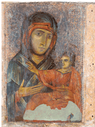
Byzantine icon dating back to the 10th-11th centuries, restored in the 12th and 13th centuries and venerated on the hill La Guardia since the end of the 12th century.