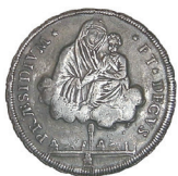
Silver ten paoli coin, minted in Bologna in 1796