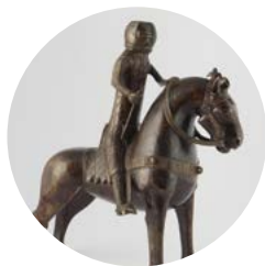
bronze, 12th cent. Lower Saxony or Mosan region

The monument was erected in honor of Nero by the Bolognese as a sign of gratitude; the Emperor had financed the reconstruction of Bologna after the fire of 53 A.D.