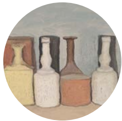
Giorgio Morandi (1890–1964)