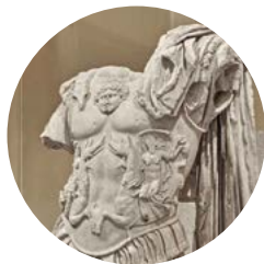
marble, probably Greek Pentelic marble mid 1st century A.D. atrium/plaque from Bologna, Piazza Celestini