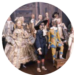
Venian artistry, 18th cent.

This painting is part of four series that constitute the richest and most homologous collection of Creti's paintings in any museum. This work depicts a reference to the Trojan War.