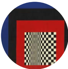
Francesco Vezzoli (1971)

This large group of marble sculptures from 1891 unites Verist and Art Nouveau influences.