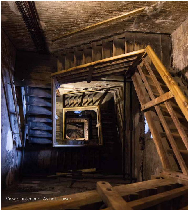
View of interior of Asinelli Tower

They are the landmark of the city. The taller one -Asinelli- was raised to the current 97.2 m when it became Municipal property (at the end of the 13 th century). Originally, it had a height of about 60 m: from that point upward the walls actually become thinner showing the builder's intention to raise the tower's height without overburdening it with a weight that could have made it unstable. Moreover, the current height would have been completely pointless for the tower's original (defensive) purpose, while it served the need of the Municipality for a beacon tower to communicate with the countryside. The Garisenda tower must have been 60 m high too before it was lowered to 47.5 m mid-14 th century for fear it would collapse; sure enough, the tower's tilt