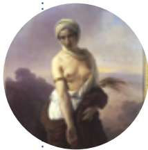
Francesco Hayez (Venice, 1791 – Milan, 1882)