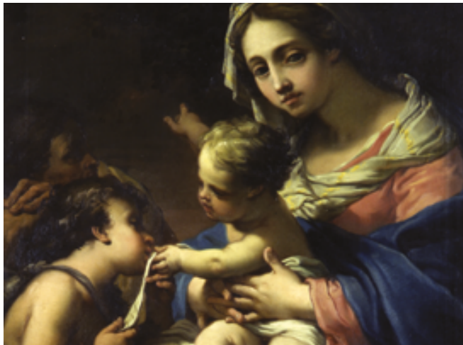
↗ Gaetano Gandolfi, "Sacra Famiglia con San Giovanni Battista bambino", 1787, Oil on canvas, 79,2x103cm

Sala Urbana exhibits paintings from the 18th century, usually divided between the Vidoniana Gallery and rooms 8 and 9. The itinerary continues in rooms 14, 15 and 16 (Boschereccia), where it has been re-created an itinerary dedicated to the evolution of the landscape between the eighteenth and early nineteenth century and where you can admire the Apollino by Antonio Canova. In room 18 the wing Rusconi's first baroque living room has been relocated and from here you can reach three additional rooms (23, 24, 25) that lead back to the Sala Farnese.