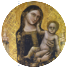
Vitale da Bologna (doc. between 1330 and 1359)

The painting is one of the artist's masterpieces and depicts a biblical scene accentuated by its sensual beauty with a hint of melancholy. The colour range is based on subtle shade variations - from sand to earth - that exalts the provoking body of the gleaner.