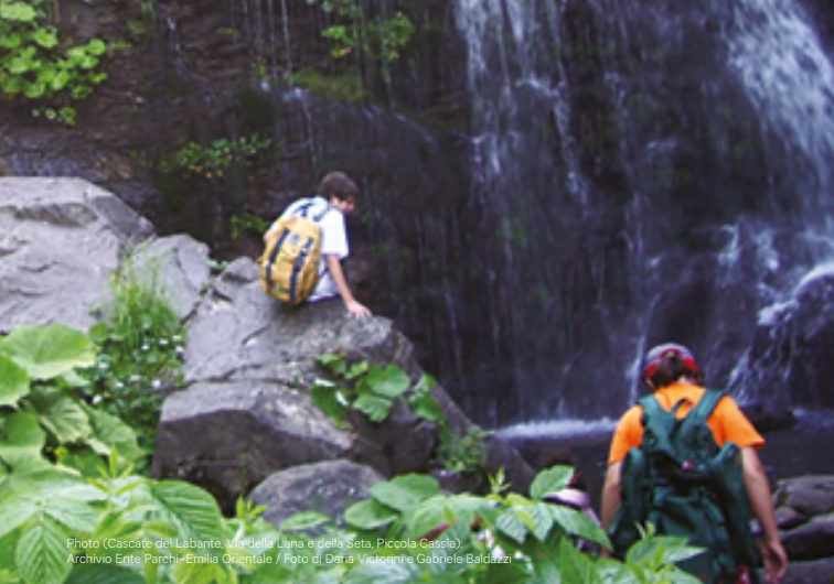
Photo (Cascate del Labante, Via della Lana e della Seta, Piccola Cassia).