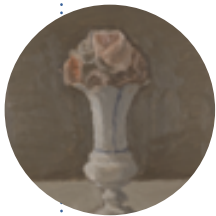
Giorgio Morandi (1890–1964) 1950 oil on canvas, 36x30 cm Istituzione Bologna Musei | Museo Morandi