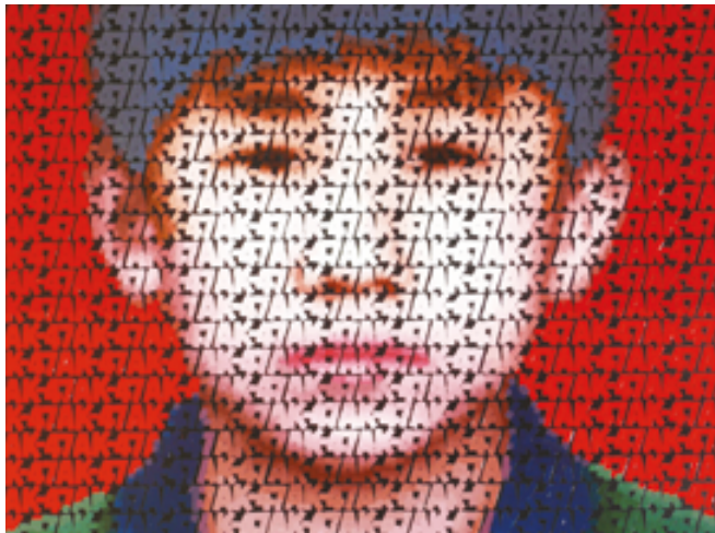
AK-47 (H8), 2008, acrylic on canvas

– human and architectural, material and immaterial – permeating the urban space.