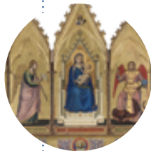
Giotto (c.1267–1337) Giotto (1267ca-1337) "Bologna Polyptych", 1330-1334ca, tempera and oil on panel, 146.5x217cm

The theme of flowers is recurrent throughout Morandi's artistic research – he preferred fresh flowers during his youth and dried or silk ones in his later years. In this composition, the tall thin vase holds a small bunch of roses, which seem to almost peer over the edge projecting their shade onto the table.