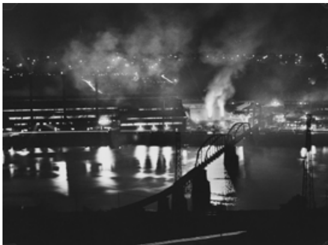
↗ National Tube Company works, U.S. Steel Corporation, McKeesport, and Union Railroad Bridge over the Monongahela River, 1955-1957