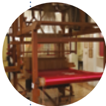
Telaio Jaquard 18Th century