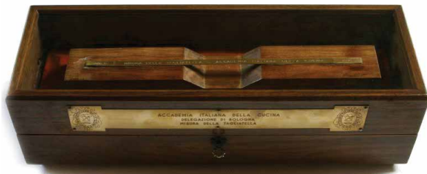
Official sizing of the tagliatella

Since the end of the XIV century until the end of the XVII century the Palazzo della Mercanzia di Bologna, also known as Loggia dei Mercanti or Palazzo del Carrobbio, hosted the Universitas mercatorum (merchants' academy) and also the seat of some local guilds. From 1797 on, with the French occupation it became the seat of the Chamber of Commerce. From 1972 on inside its premises was put on display a golden template of the authentic Bolognese noodle (Tagliatella bolognese) whose width equals the 12,270th part of the Asinelli Tower. This is a typical local example of the procedure applied internationally to define standard units of measurement.