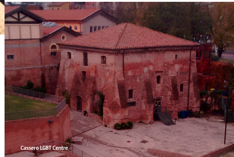
Cassero LGBT Centre

This building, an old salt warehouse, lies inside the Manifattura delle Arti , which also includes the Film Library (Cineteca) of Bologna, the Departments of Music and Entertainment and of Communication Sciences of the University of Bologna and MAMbo. The Salara building hosts the Cassero LGBT Centre, the oldest LGBT Italian association which is also the office of Arci Gay in Bologna. It also hosts many other LGBT associations. Inside the building lies the Arcigay Cassero documentation centre, the most important LGBT library in Italy and one of the most important ones in Europe. It was founded in 1983 to promote, preserve and make available to the public critical processing tools on sexuality, gender identity and social exclusion. The centre includes a large collection of materials on the history of Cassero (the first Italian homosexual association to obtain a seat owned by a municipality, in 1982). www.cassero.it