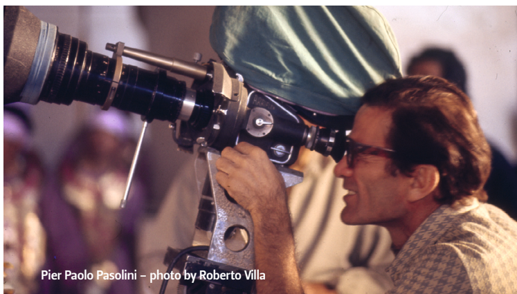
Pier Paolo Pasolini