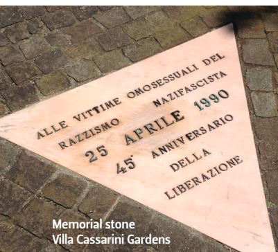
Memorial stone Villa Cassarini Gardens

Porta Saragozza is the place that shows the long-term presence of the LGBT community in Bologna. In 1982 the City Council guided by Mayor Zangheri gave the place to one of the first LGBT associations of the city, the Circle of homosexual culture 28th of June , leading to some criticism. The place remained the seat of the largest association for the rights of gays, lesbians