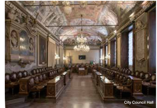
City Council Hall

Jupiter is waiting for her. 3) Bacchus, Pomona and Caeres (referring to wine, fruit and harvest) are the symbols of the fertile soil of Bologna. On the second shorter wall: Vigilance and Prudence and the symbols of the Arts.