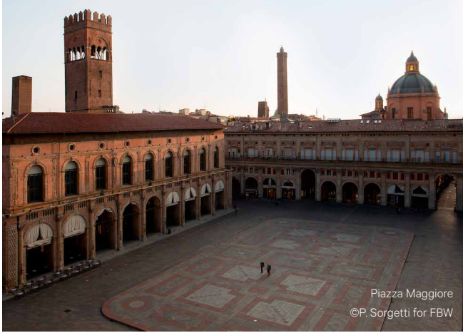
Piazza Maggiore