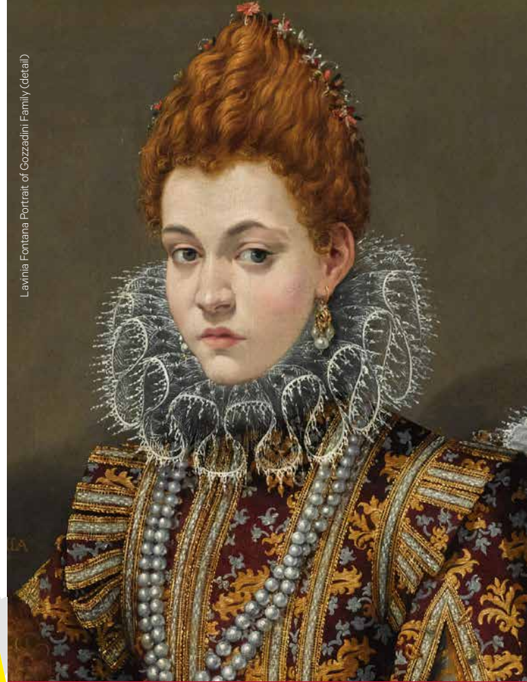
Lavinia Fontana Portrait of Cozzadini Family (detail)