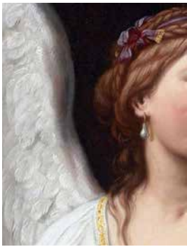
Sirani Elisabetta - An Allegory of Virtue (detail)

Fifteen Mysteries of the Rosary were completed, the paintings surround the niche with the image of the Blessed Virgin Mary. The paintings were commissioned to famous painters from Bologna: Jesus among the Doctors is a work by Lavinia, as well as The coronation of the Virgin . She was called to Rome to work there and she stayed there until her death, in 1614. In 1665 the funeral of young Elisabetta Sirani was held in this basilica, she had died two months and a half before but she was buried only after long investigations.