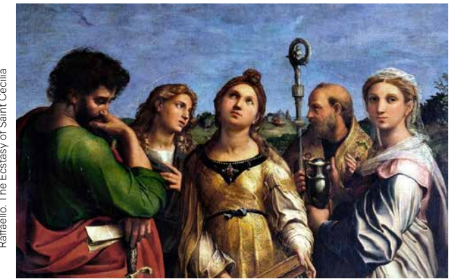
Raffaello. The Ecstasy of Saint Cecilia

Here is preserved the grave of Blessed Elena Duglioli (1472-1520). The Ecstasy of St. Cecilia by Raphael was made for her, now it is kept in the National Gallery of Bologna (Pinacoteca Nazionale di Bologna), and a