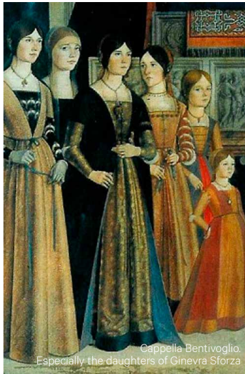
Chappella Bentivoglio Especially the daughters of Ginevra Sforza

A fresco of the Bentivoglio Chapel portrays all the members of the noble family under the protection of the Virgin Mary on the throne: Giovanni II, lord of the city, his wife Ginevra Sforza and their numerous children. Ginevra, daughter of the lord of Pesaro, came to Bologna in 1454 to marry Sante Bentivoglio, lord of the city, when she was only 12. When he died, Ginevra married Giovanni II Bentivoglio, who was her own age. Their marriage was not a marriage of convenience but a real bond. Not only did they have sixteen children, but they also worked together to strengthen