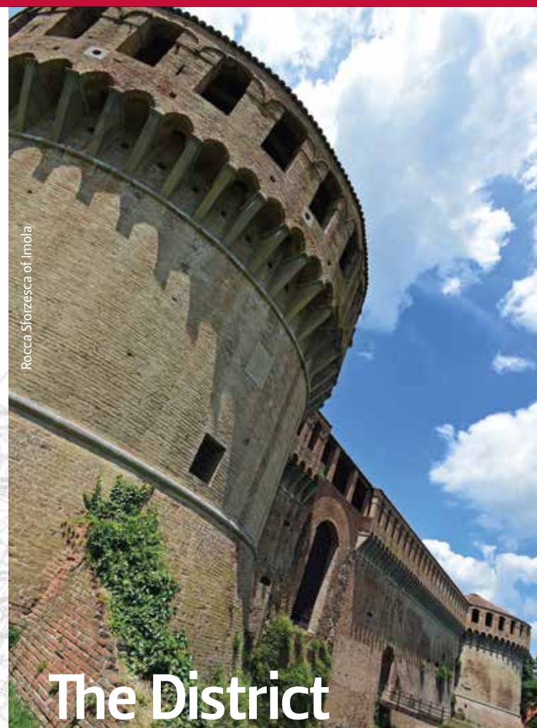
Rocca Sforzesca of Imola