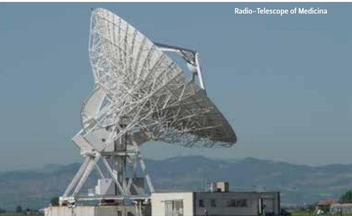
Radio-Telescope of Medicina

The entrance to the historic center of Mordano (n. 8) is accented by two late-1800s battlement towers, while the large 15 th century Tower of the Sforza family is currently home to a museum on the history of the local area. Also worth visiting is the Municipal Theater which, already at the end of the 19 th century, hosted a local company of dramatic actors. The auditorium maintains its original appearance, with the wooden balcony and wrought iron railings. Castel Guelfo (n. 9) is a typical plain-land fortified borough, which has kept its late-medieval structure intact. Donated to the Church by the Canossa dynasty, the Castle was then passed on to the Malvezzi, who in the 15 th century, turned it into a small city-state. Its imposing walls, four corner towers and fort frame the streets, churches and buildings of its elegant historic center. Particularly interesting are Palazzo Malvezzi-Hercolani, with its lovely courtyard and twin orders of porticoes, Palazzo del Podestà, with its mix of medieval and Renaissance styles, and the late-1700s Church of the Sacred Heart.