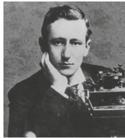
Guglielmo Marconi.

Here is located Guglielmo Marconi's home. The plaque on the front wall reads: "Here Guglielmo Marconi was born, the one who first sent the word on the waves of electricity without the help of cables or wires...". Thanks to this extraordinary discover in 1909 Marconi was awarded the Nobel Prize for Physics, never given before to an Italian scientist. The evidence of his work is the Marconi Museum at Villa Griffone in Sasso Marconi, his father's home and summer residence, where the physicist developed a system of wireless telegraphy later spread all over the world. www.fgm.it