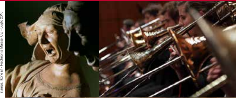
stamps: Irene srl - Picaforte Melassi (CB) - Luglio 2016

The portico of the Pavaglione, the portico of the Death, the portico of the Annunziata, the portico of the Servi, the portico of the Bank of Italy, the portico of the Canton de' Fiori (the flower