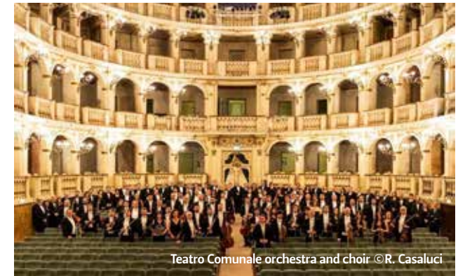
Teatro Comunale orchestra and choir

On the sidewalk along via Orefici and via Caprarie a series of stars in the 'Walk of Fame' style pays tribute to the names of the famous jazz musicians of the '50s, '60s and '70s: Duke Ellington, Miles Davis, Chet Baker and others. These were the guests of the great international jazz festival that was hosted in Bologna every year from the '50s to the '70s. The jazz tradition in Bologna is witnessed by the 'Doctor Dixie Jazz Band', the longest established jazz band in the world, founded in 1952. The jazz culture is a contemporary expression of the Bolognese century-old music tradition the most important places of which are the Teatro Comunale, the G. B. Martini Conservatoire, the International Music Museum and the Mozart Hall at the Accademia Filarmonica. In 2006 Unesco declared Bologna Creative City of Music. It's the only Italian city to have been awarded such an important recognition.