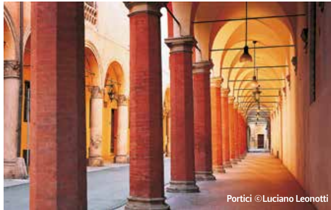
Portici

The University of Bologna has conventionally been dated back to 1088. It is the first university in Europe, founded before those of Oxford, Paris and Cambridge. In the first centuries of its history the Studium (that's how it is called the university) didn't have a fixed location. Instead there were various places where well known professors of law and liberal arts gave lectures. Evidence of the record of being the oldest university in Europe are the monumental tombs of university professors in the Civic Medieval Museum. They depict scenes of professors teaching and students attending lessons. This is a cross-section, genuine, vivid and authentic, of university daily life in the Middle Ages. www.museibologna.it/arteantica