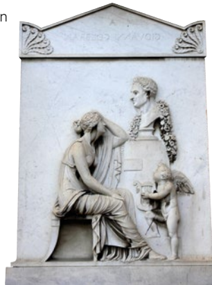
The Colbran-Rossini's grave