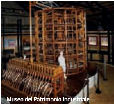
Museo del Patrimonio Industriale

The focal point of the section is a working model of a silk mill, scale 1:2, rebuilt to evoke the memory of this astonishing machine lost in the 19th century. www.museibologna.it/patrimoniindustriale