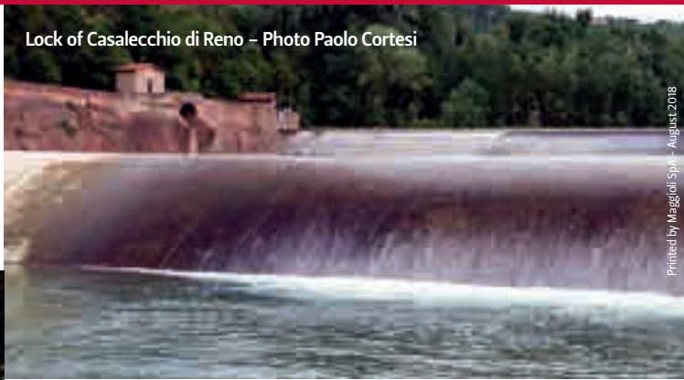
Printed by Maggioli SpA – August 2018

and return to the river the gravel and sand that would reduce the riverbed if deposited.