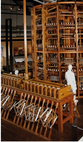
Industrial Heritage Museum

Built in 1887 by Celeste Galotti, the brickworks with its Hoffmann furnace was used until 1966. The Museum illustrates the economic history of the city and its surrounding area, from the Modern to the Contemporary Age. An interesting section shows how between the XV and the XVIII centuries Bologna was a centre of silk production, thanks to technological innovations and a system of production that used water power. The focal point of the section is a working model of a silk mill, scale 1:2, rebuilt to evoke the memory of this astonishing machine lost in the 19th century.