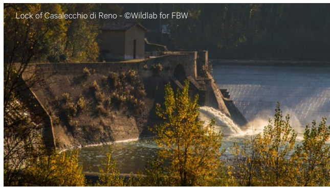
Lock of Casalecchio di Reno

The current structure of the lock on the Reno dates back to 1894, built after the river overflowed its banks, and is a real “hydraulic monument”, stretching the entire width of the river. It consists of the lock itself (the oldest part about 160 meters long) and an overflow (85 metres); between them there is a sturdy watershed. Just downstream of the lock of Casalecchio are the Paraporti: Scaletta, Verocchio and San Luca. Together these hydraulic works are able to clean the channel and return to the river the gravel and sand that would reduce the riverbed if deposited.