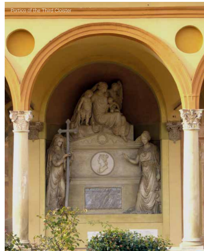
Portico of the Third Cloister