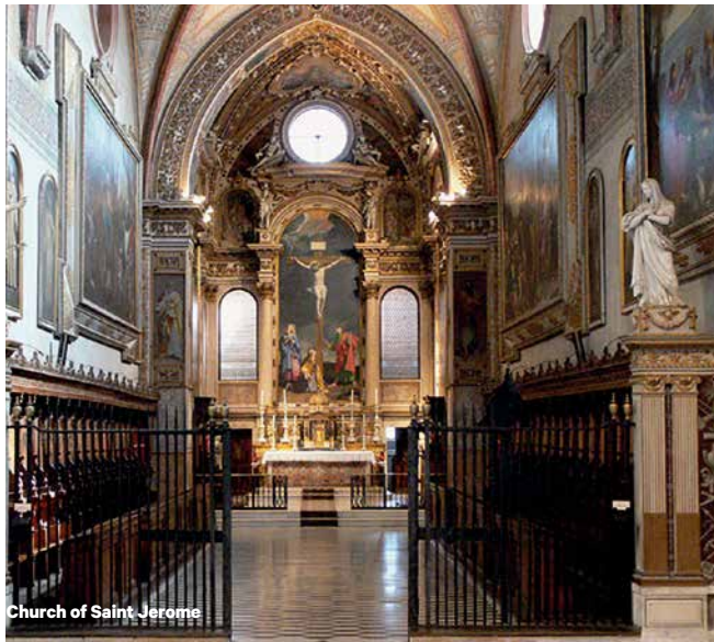
Church of Saint Jerome

The cemetery was established in 1801 using the former buildings of the Carthusian monastery, which was built starting from 1334 and closed by Napoleon in 1796. The Chiesa di S. Girolamo (1) testifies to the lost wealth of the monastery. The walls house the great cycle of paintings dedicated to the life of Christ, created by the leading artists of Bologna in the mid XVIII century.