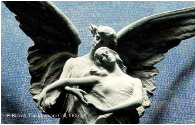
P. Rizzoli, The Magnani Cell, 1906

In the north-west area of the Certosa (16) there are several cloisters and fields that the Council, over time, has allocated for the burial of people with different religious or burial beliefs. Overlooking the access road stands the small Evangelical Cloister, where people belonging to the Anglican or Protestant Church can be laid to rest; while a little further on is the first Crematorium Altar building, located next to the Cinerary Cloister and Chamber. The three fields set aside for Jews since 1869, are Bologna's visible testimony of the small but very important local Jewish community. In addition to the simple memories that reflect religious dictates, there are also monuments of greater monumental undertaking, sometimes adorned with portraits, symptom of the desire to indicate, after having achieved the civil and religious rights of the eighteen hundreds, their belonging to Italian society.