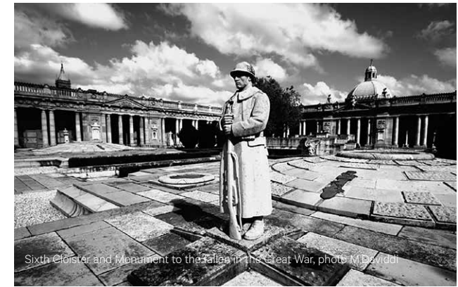
Sixth Cloister and Monument to the fallen in the Great War