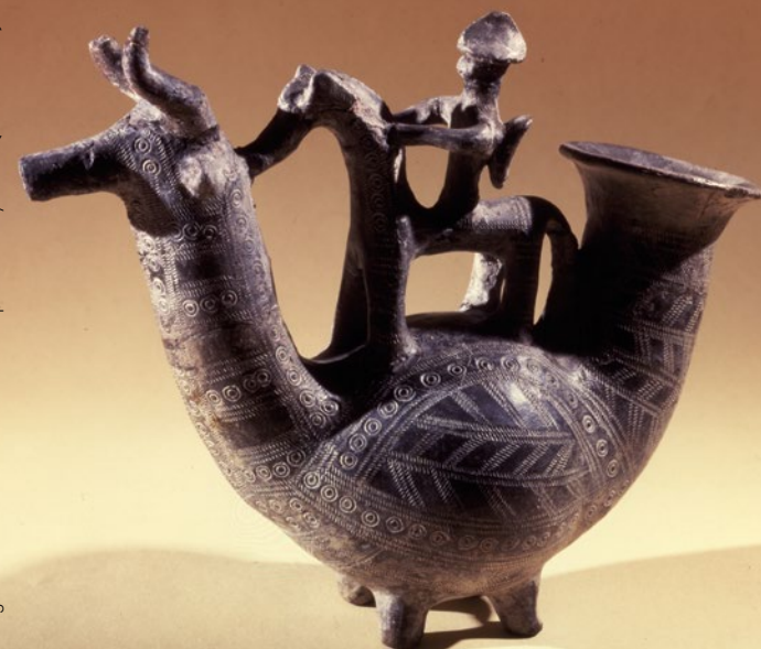
Archaeological Museum. Vase with a rider on top of a fantasy animal (720-680 B.C.)

Here you find significant evidence of the town and necropolis of Monte Bibele. Both are extremely important for the study of the Celts in Italy and the relationship between them and the local Etruscans. The great invasions of Celts from the other side of the Alps began in the early 4th century B.C. and many settled in the area of Bologna. In the small highland settlement of Monte Bibele the Etruscans mingled with these new arrivals. Wonderful burial objects of Celtic