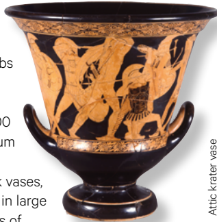
Attic krater vase