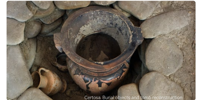
Certosa. Burial objects and tomb reconstruction