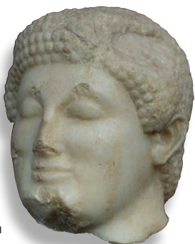
Head of a kouros (youth)

warriors, including helmets, swords and javelins, prove how the different populations met and shared the living and burial space for more than two centuries. At the beginning of the 2nd century B.C., the arrival of the Romans changed forever the balance of the population of the whole area of Bologna. About 10 km from the Fantini Museum is the Monte Bibele Park where you can have a walk in the beautiful woods and visit a unique and fascinating archaeological site.