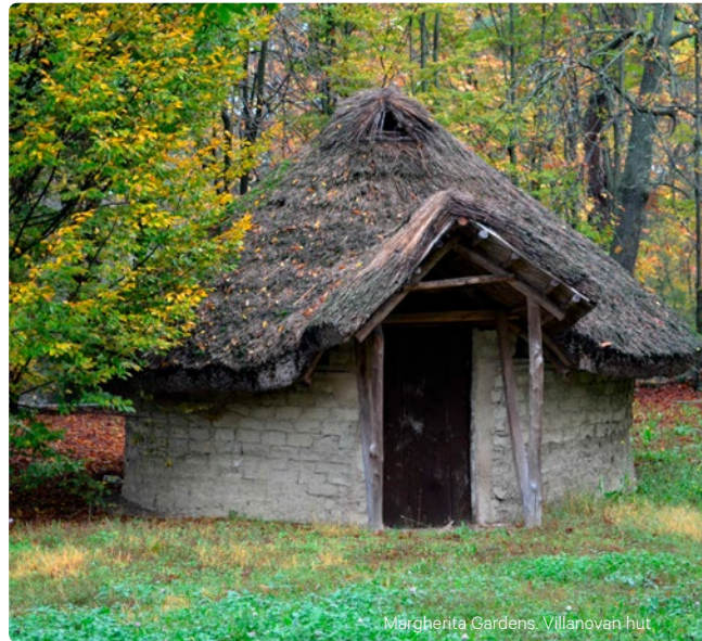
Margherita Gardens. Villanovan hut

container was found which clearly dated back to the Etruscan age. This first discovery led to many excavation campaigns which brought to light more than 230 tombs. These dated from the middle of the 6th century to the beginning of the 4th century B.C. The burial objects from these tombs are kept in the Archaeological Civic Museum. There is still an imposing stone sarcophagus dating to the 5th century B.C. on the large lawn near the lake in the centre of the park. This is a clear evidence of the ancient Etruscan burial ground. A few steps from the sarcophagus, near the old municipal greenhouses, the Margherita Gardens have a surprise for lovers of the ancient world: the perfect reproduction of a Villanovan hut, the type of house common in the oldest phase (Villanovan age) of the Etruscan settlement in Bologna. The hut was recreated on a 1:1 scale, according to traces found during the archaeological excavations and was built with the same materials of the Etruscan age (wood, clay and reeds). It faithfully reproduces the shape and structure of the old houses.