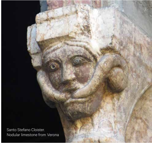
Santo Stefano Cloister. Nodular limestone from Verona

Istrian limestone, extracted since the Roman period, is widespread throughout the city, where it arrived from the quarries of Croatia, going through Trieste, Venice, Ravenna and reaching Bologna by river.