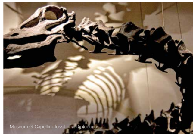
Museum G. Capellini: fossil of a Diplocodus

University Museum System Alma Mater Studiorum University of Bologna www.sma.unibo.it